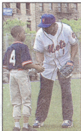
Mookie Wilson chatting up a young baseball hopeful at his clinic