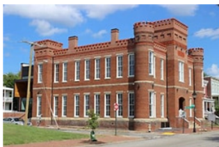
122 W Leigh St, Richmond, VA 23220

Black World Series is a story intended to motivate and inspire readers while gathering support for the MJBL program, which is still in operation today. Fans of true stories about overcoming adversity and preserving against incredible odds will find Black World Series a great addition to their home library.